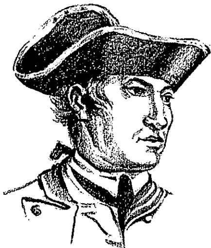
General Sir William Howe

Prior to the war, Governor Dunmore of Virginia wrote that the 'patriot committee . . . assumes an authority to inspect the books . . . and all other secrets of merchants; to watch . . . every inhabitant and . . . to interrogate them . . . Every county is now arming a company for the . . .