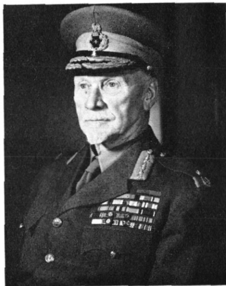
General J. C. Smuts

This and other attempts at moderation did bring about some suggested franchise reforms, proposed on 13th August by J. S. Smuts, Kruger's State Attorney. However, Smuts had already (May) observed that Kruger regarded war as 'inevitable or likely to become so' 70 — and this was before the Bloemfontein Conference.