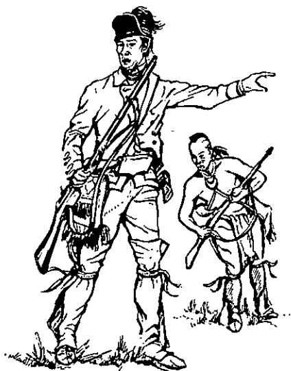
Loyalist guerilla and Indian ally

leaving his victims, according to Marion, 'Sitting in the open Air round a fire without . . . any Cloathing but what they had on'. 53